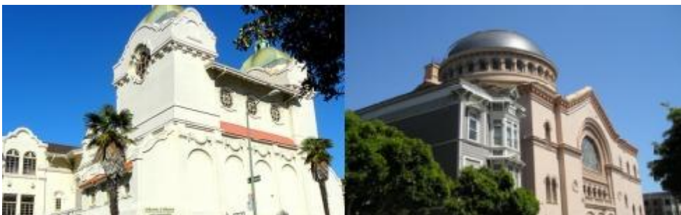
The Islamic Cultural Center of Northern California in Oakland and Congregation Sherith Israel in San Francisco, both welcomed in our Unity Program students.

This month the Unity Programs have been full of exciting classes, field-trips, and conversations. Classes in the East Bay focused on similarities and differences between Jewish and Muslim religious practices. Jewish students taught the