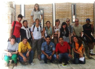
BB:IP students & staff gather for a photo in the West Bank.

Beyond Bridges: Israel-Palestine (BB:IP) is seeking ambitious, politically conscious student leaders for this one-of-a-kind summer program. Run through USF, this three-week study course takes under/graduate students of all backgrounds to Israel and Palestine. This accredited study abroad program challenges its participants to see the Israeli-Palestinian conflict from different angles by engaging narratives often absent or underrepresented in mainstream discourse. Based in Jerusalem, students travel to Haifa, Bethlehem, Tel Aviv, Hebron, and beyond to meet with scholars and activists from across the political spectrum. The 2011 BB:IP program runs from June 12 - July 3. Click here for more information.