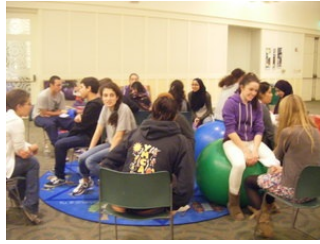
UP:SF students discuss Jewish and Muslim identities during a course meeting.