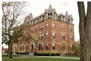
Tufts University students discussed campus activism with AV Co-facilitators.