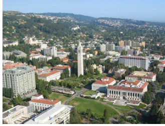
University of California, Berkeley

Identities." Students learned about how to play a more active role in transforming international conflicts in general and in the Israeli-Palestinian conflict in particular. Per norm, our students raised many good points and were ultimately left with more questions than answers.