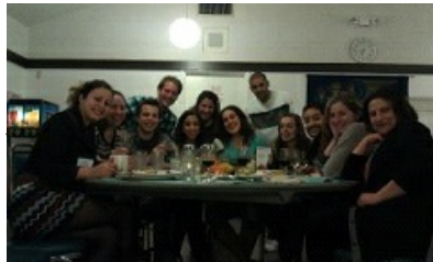
2011-12 VP Fellows in San Francisco for their Fall Conference, one of two conferences following the summer experience in the Balkans.

Vision Program fellows traveled into the San Francisco Bay Area from Israel, Palestine, and all over the US to attend the Fall Conference. Held from November 17-20, this was the first time all 12 fellows had the opportunity to see one another since their intensive trip to the Balkans, which took place in June and July.