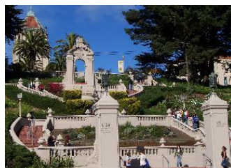
Steps Leading up to USF's Lone Mountain Campus