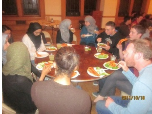
UP Students learning with and from each other through group process sessions last year.

This month Unity Program students from all three Bay Area chapters are meeting together for their first group process session. This is our seventh consecutive year of the UP. With an incredibly strong group of Co-Educators, the 2011-12 Unity Program promises to be another excellent and transformative experience.