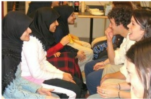
UP Students learning with and from each other through group process workshops.

This month we launched our seventh consecutive Unity Program. With an incredibly strong group of Co-Educators, the 2011-12 Unity Program promises to be another excellent year.