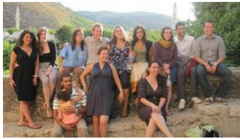
2011-12 VP Fellows in Mostar, the final city on their voyage through Serbia, Kosovo, and Bosnia-Herzegovina.

Vision Program fellows will travel from all over the US, Israel, and Palestine to attend the Fall Conference in the San Francisco Bay Area. Held from November 17-20, this will be the first time all twelve Fellows see one another since their intensive trip to the Balkans in June and July.