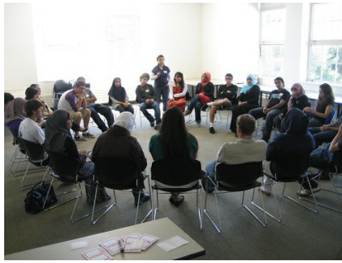
Unity Program students engage in a group discussion session.

This month we are launching our seventh consecutive Unity Program. With yet another incredibly strong group of Co-Educators and Co-Facilitators, the 2011-12 UP promises to be another powerful year. This course teaches Muslim and Jewish 15-18 year-olds about issues relevant to North American Muslim and Jewish communities and the historical relationship between these groups, while examining the richness of both Islam and Judaism.