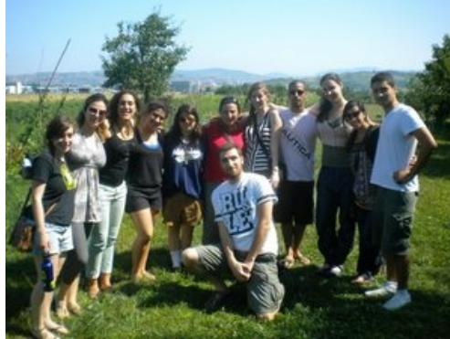
2011 Vision Program students at the War Tunnel in Sarajevo.

The sixth consecutive group of Vision Program fellows have returned from their three-week intensive experience in the Balkans, and now face the challenge of re-examining their summer while engaging with their communities regarding new ways of looking at the Israeli-Palestinian conflict. This year, the Vision Program fellows represent Earlham College, Hebrew University of Jerusalem, San Francisco State University, University of California, Berkeley, University of North Carolina, University of Vermont, and Virginia Commonwealth University.