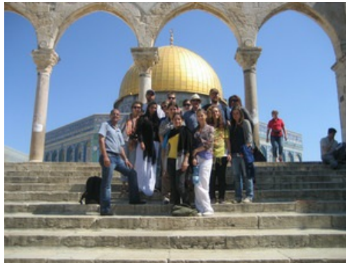
Participants pose in front of the Dome of the Rock, a renowned sacred site and landmark in the Old City of Jerusalem.

The students of the 2011 Beyond Bridges: Israel - Palestine program have completed the program and returned to their campuses eager to share their experiences with their communities. This year, the BBIP program included 16 graduate and undergraduate students representing the University of San Francisco, University of California: Riverside, and Richard Stockton College of New Jersey.